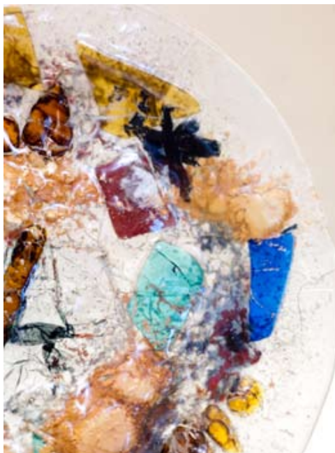
Glass Fused dish

The Ceramics Studio offers Open Studio time to its currently enrolled students. During designated hours, students will be welcome to use the Studio's facility and equipment to continue working on projects done in class, as well as on independent projects. Please check the bulletin board in the entranceway for Open Studio dates and times. For more information, please call 973-259-5152.